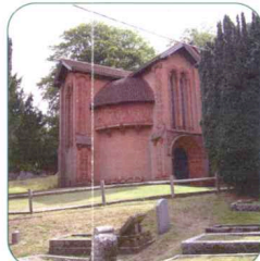
The Watts Chapel