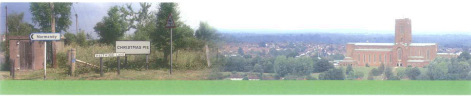
▶ Christmaspie village and view of Guildford Cathedral